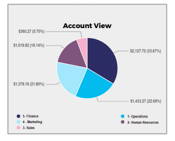
Activity by Account